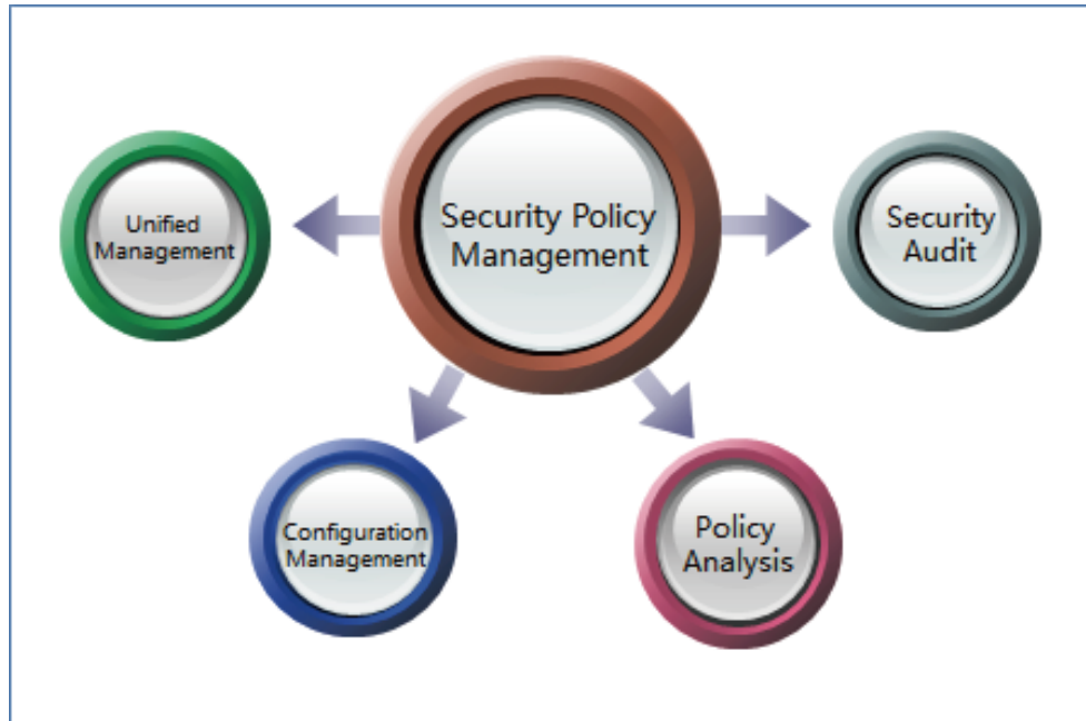
Figure 2 Joint Solution Features